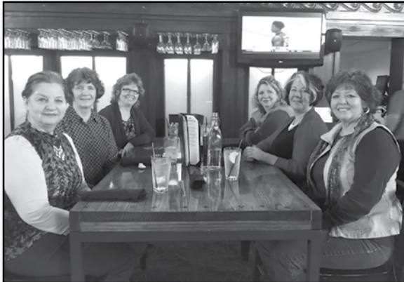
The Molitor Ladies enjoy a Sister's weekend in KC