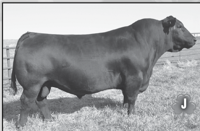
SAV Resource 1441 (Reference Sire J)