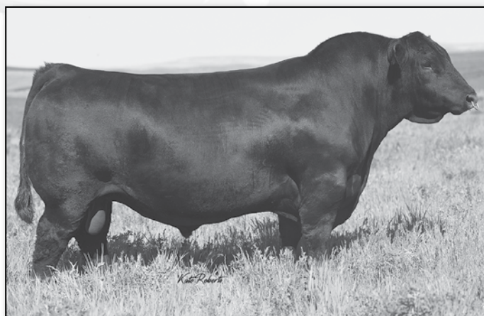
Ellingson Chaps 4095 - Reference Sire B.