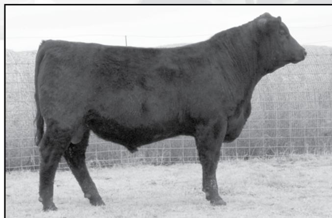
Molitor Cowboy Up 504-1018 - Lot 51