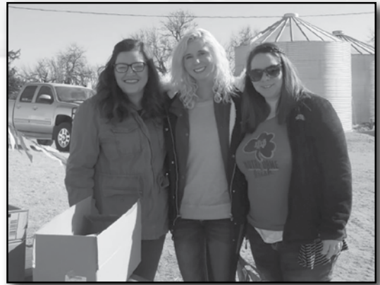
Sale day welcoming crew.