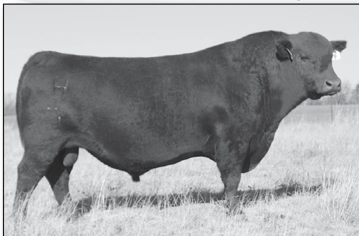
HA Outside 3878 - Reference Sire F.