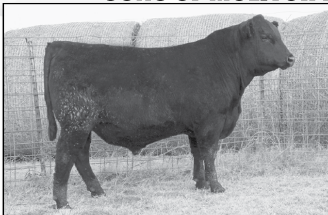
Molitor 165 Payweight 488-358 - Lot 1