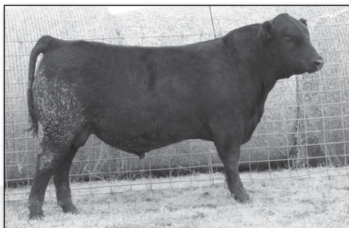
Molitor Advance 6021-618 - Lot 88