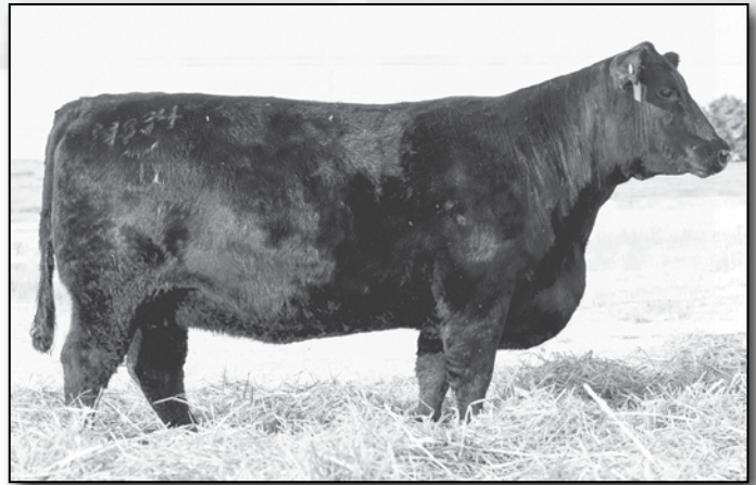
DAR MS Upgrade N834 - Dam of DAR Pay Upgrade Q807 (Reference Sire L).