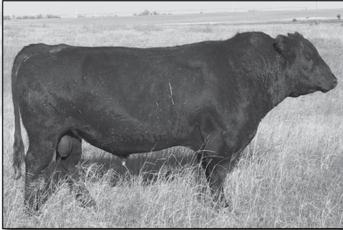
Molitor KG Solution 9736-574 - Reference Sire G.