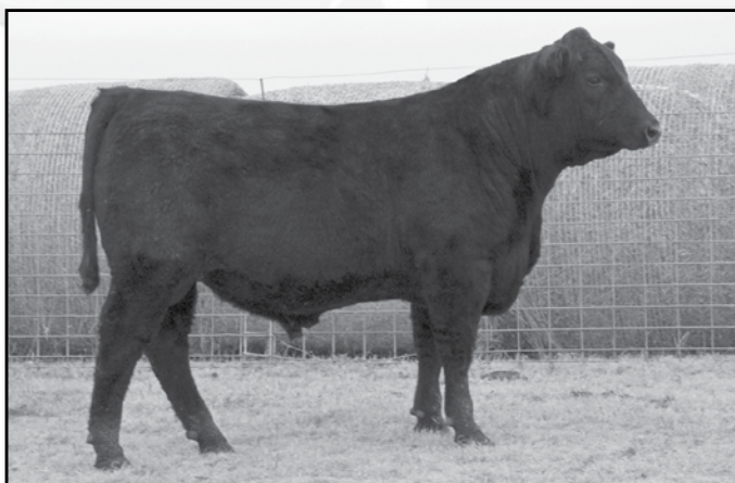
Molitor Cowboy Up 414-1068 - Lot 49