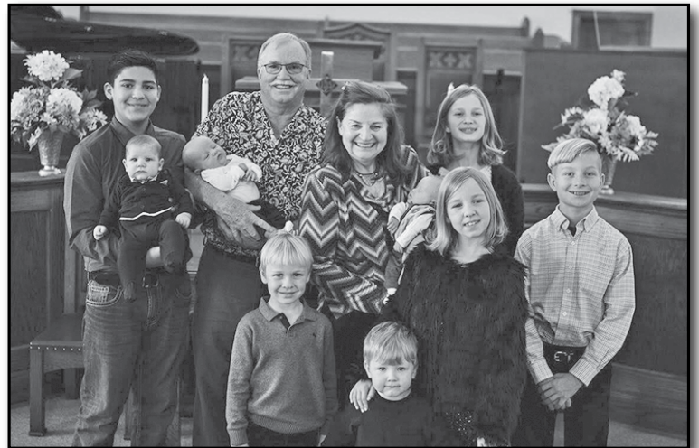
The Oaks with all their grandchildren.