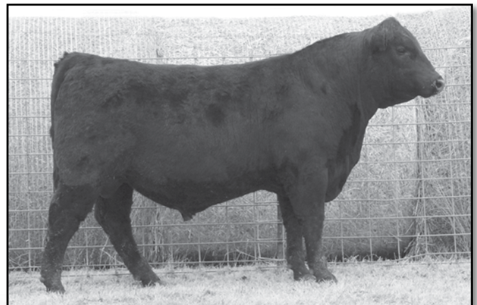
Molitor Chaps 4012-1348 - Lot 18