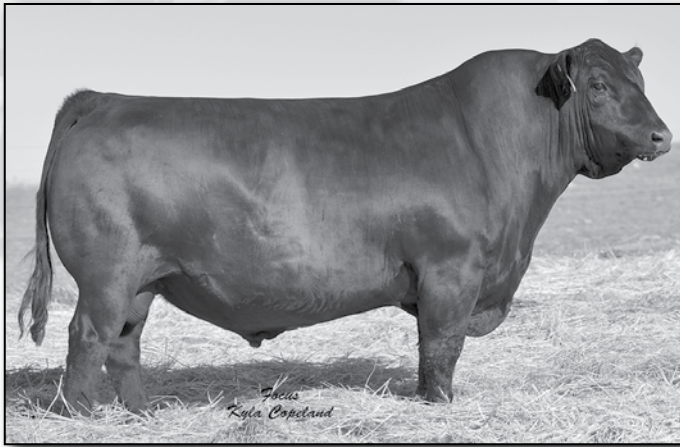
Basin Payweight 1682 - Sire of DAR Pay Upgrade Q807 (Reference Sire L).