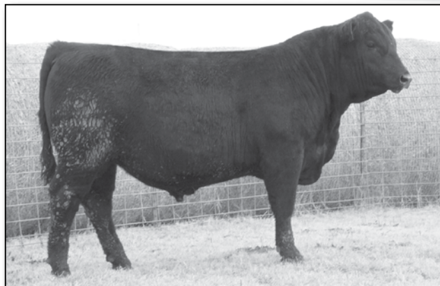
Molitor Q807 Payweight 321-438 – Lot 101 Molitor Q807 Paywght 321-438

101 Birth Date: 2-28-2018 Bull 19316995 Tattoo: 438