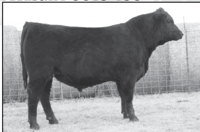
Molitor 165 Paywght 5017-328 - Lot 3

In the sale we are excited to offer several new AI bloodlines, including Ellingson Chaps, Cowboy Up, Whitlock, Baldrige Compass, Pay Raise 4886, and Charlo. Starting the catalog listing this year will be a powerful lineup of bulls by Molitor Payweight 3015-165. Those grandsons of Payweight and KG Solution can be used as an outcross to most pedigrees and can also be used on descendants of Payweight and KG Solution who are proven and genetic defect free sires and dominate the dynamics of the Molitor herd.