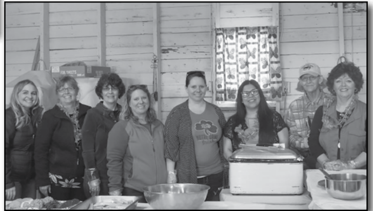
Sale day lunch crew.