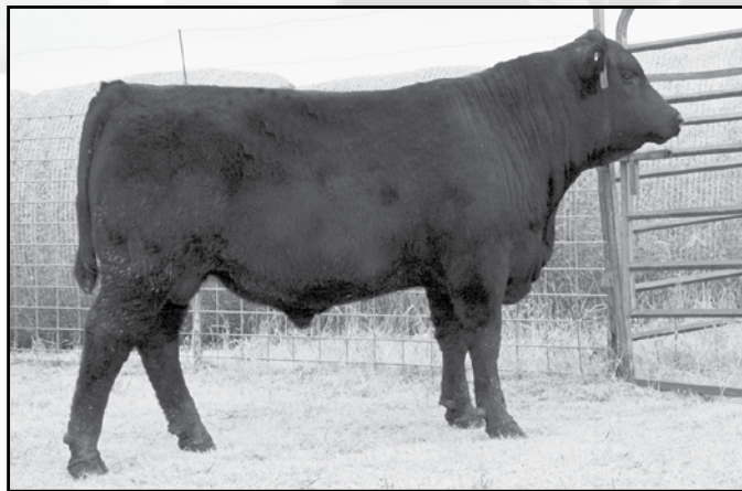
Molitor 165 Payweight 535-308 - Lot 3