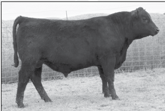
Molitor 574 Solution 507-878 - Lot 68