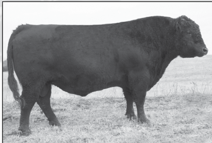
HARB Playboy 581 JH - Reference Sire H.