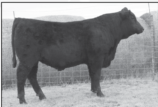
Molitor Whitlock 3006-1188 - Lot 28