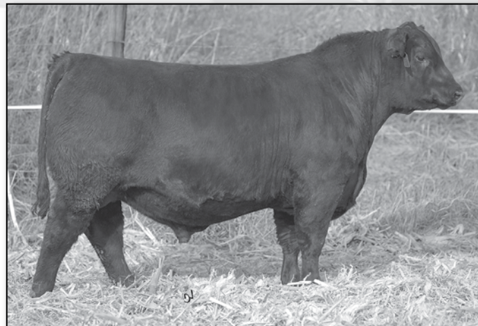
Baldrige Compass C041 - Reference Sire D.