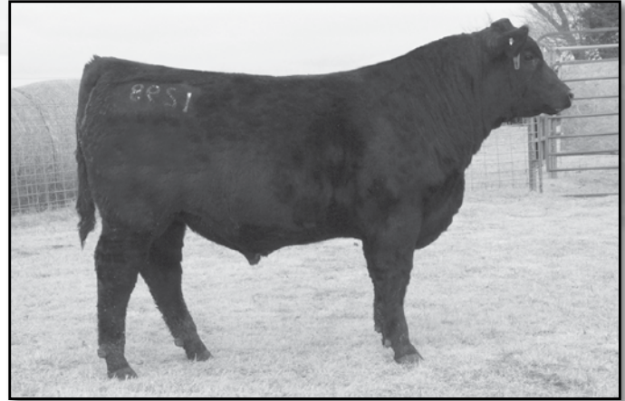
Molitor Chaps 4018-1298 - Lot 22