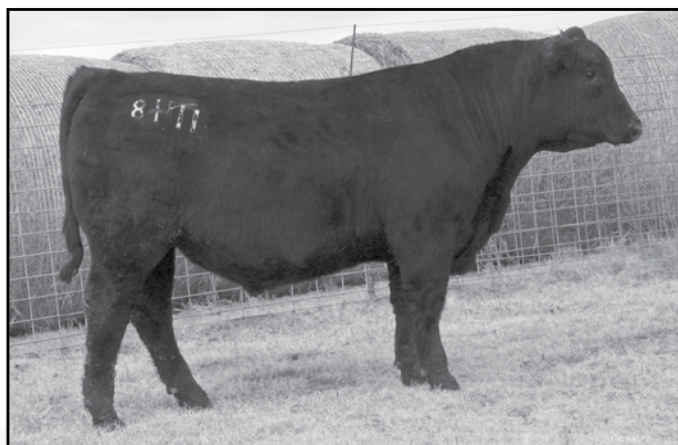
Molitor Whitlock 665-1148 - Lot 27