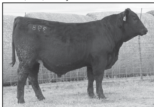
Molitor 165 Payweight 334-398 - Lot 9