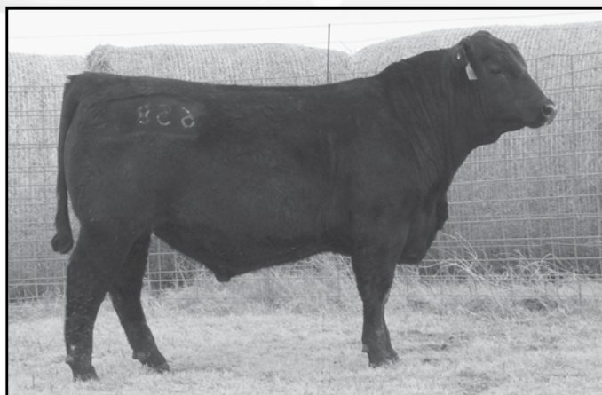
Molitor Compass 664-658 - Lot 38