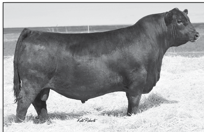
HA Cowboy Up 5405 - His sire is a 3/4 brother to HA Outside 3878, Reference Sire F.