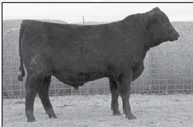
Molitor 165 Payweight 539-338 - Lot 10