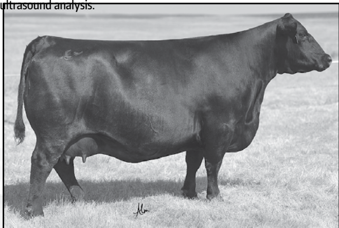
Baldridge Isabel Y69 - Dam of Baldridge Compass C041