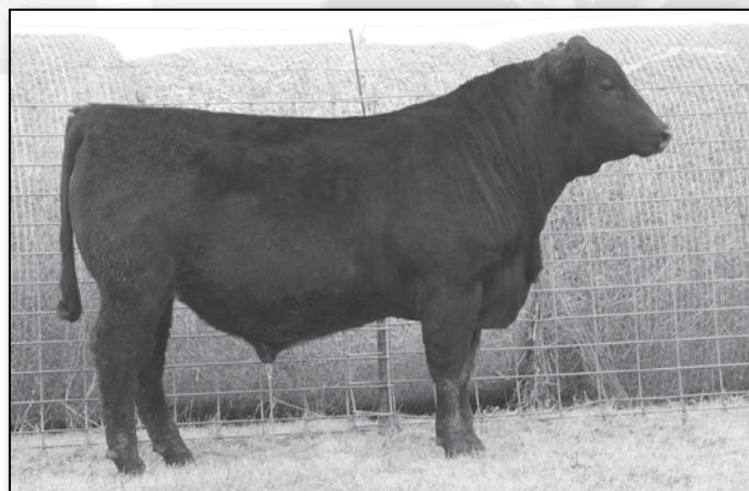
Molitor Outside 509-798 - Lot 60