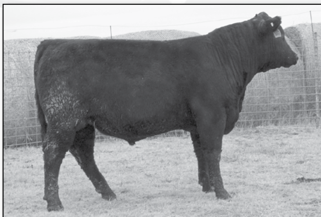
Molitor Playboy 557-178 - Lot 81