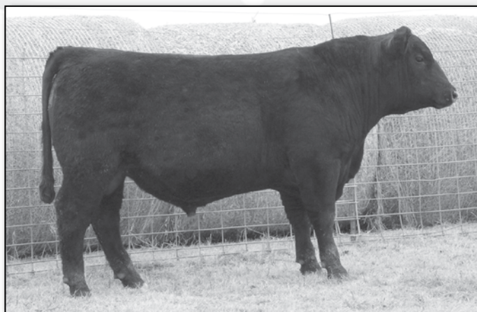
Molitor Outside 256-748 - Lot 58