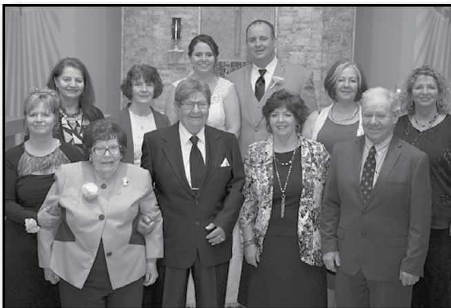
and now! 40th Anniversary