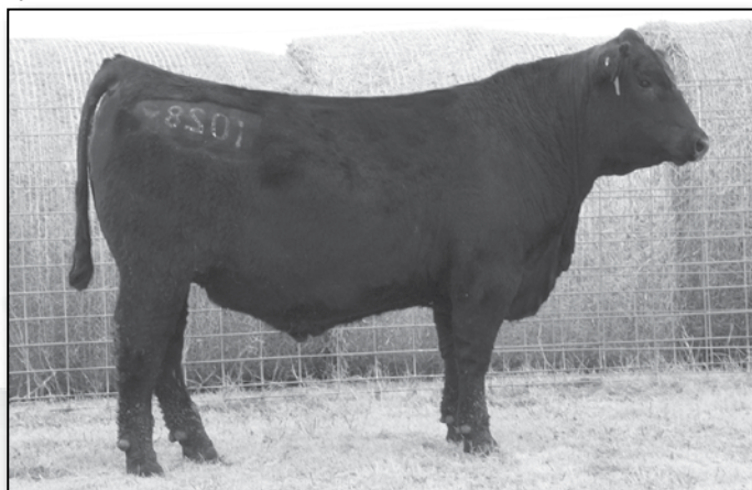
Molitor Cowboy Up 236-1028 - Lot 45