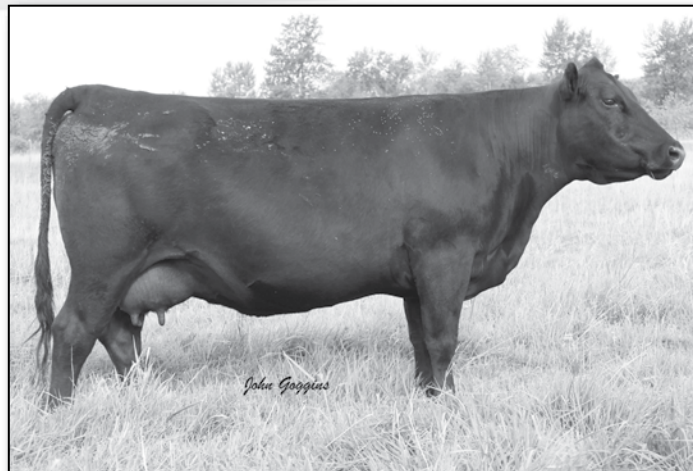
HARB Jerica 876 JH - Dam of HARB Playboy 581 JH