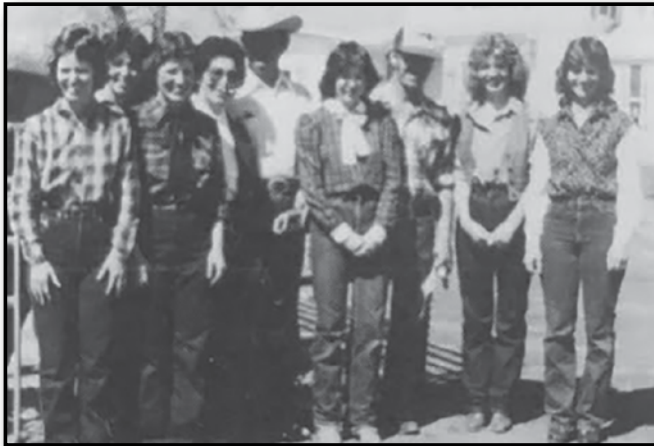
In 1980 then