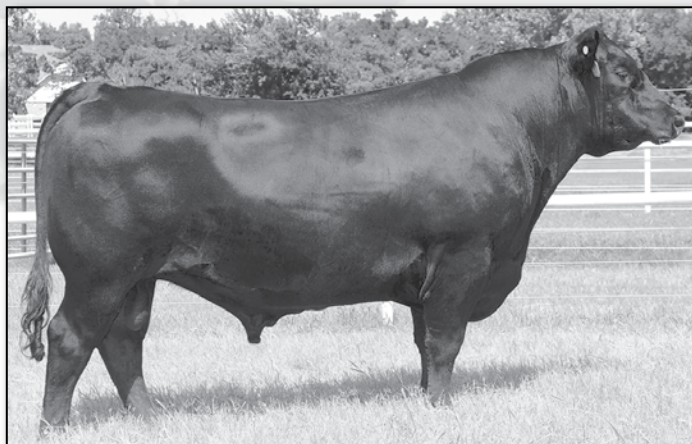
Basin Advance 3134 - Reference Sire K.