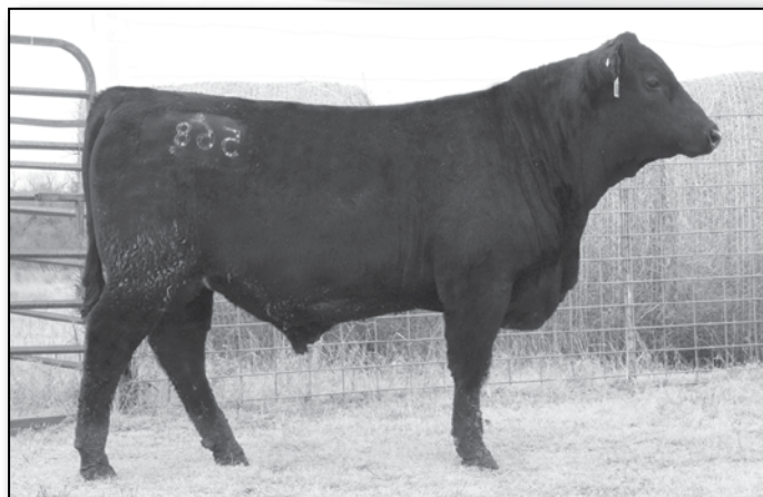
Molitor Advance 3023-568 - Lot 92