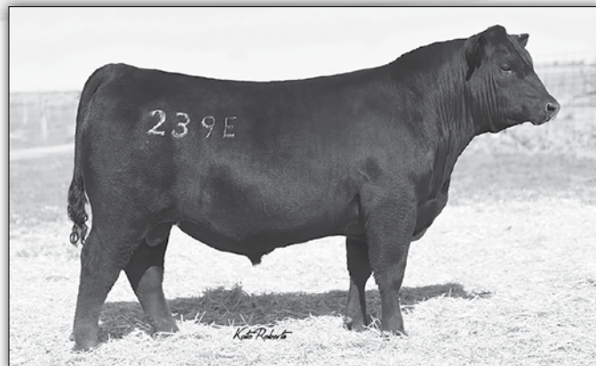
Ferguson Trailblazer 239E - Reference Sire A