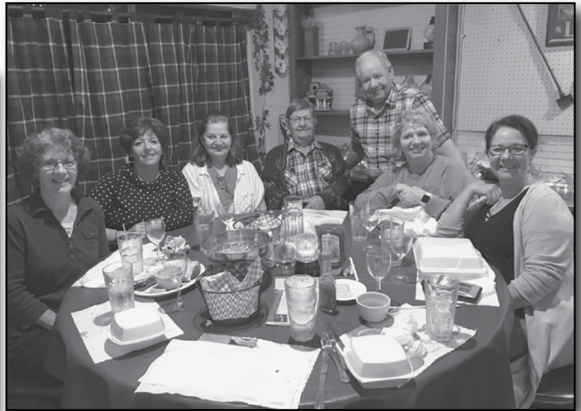
Family time at the Lumber Yard restaurant.