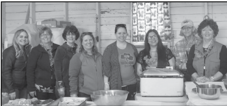
Sale day lunch crew!