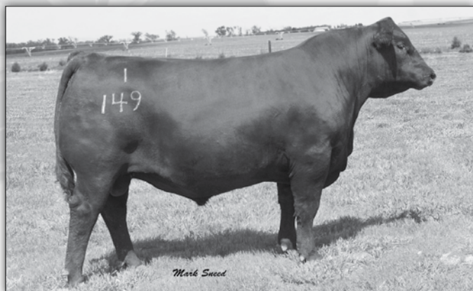
Connealy Cavalry 1149 - Sire of SVF Calvary B323 - Reference Sire P