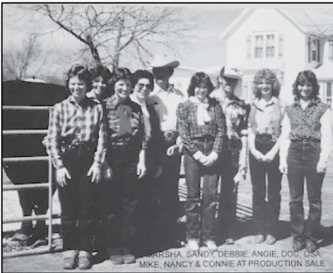
1980 first production sale then....