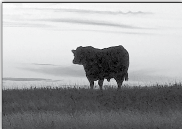
HARB Playboy 581 JH

• A calving ease trait bull with economic traits to improve the profit line in your cow herd by reducing feed cost. He is in the Top 20% for CED, BW, $Wean, $EN and Reduced MW and MH.