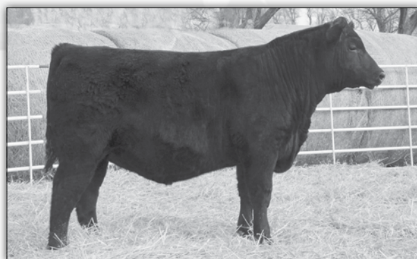
Molitor Trailblazer 5028-810 - Lot 4