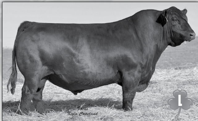
Basin Payweight 1682 - Sire of Lots 76 and 77