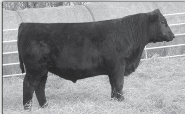
Molitor Playboy 574-210 - Lot 78