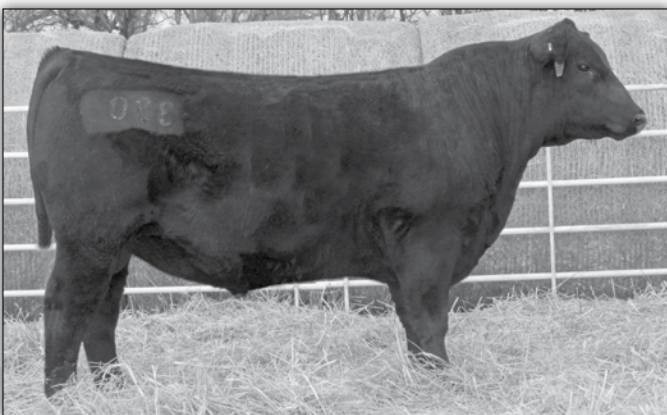
Molitor Bankroll 455-390 - Lot 12

• The Pathfinder Dam continues to be one of our most productive cows with an amazing WR 109 on 5 calves. This bull selling ranks in the Top 20% or better for CED, BW, YW, Scrotal and $Wean.