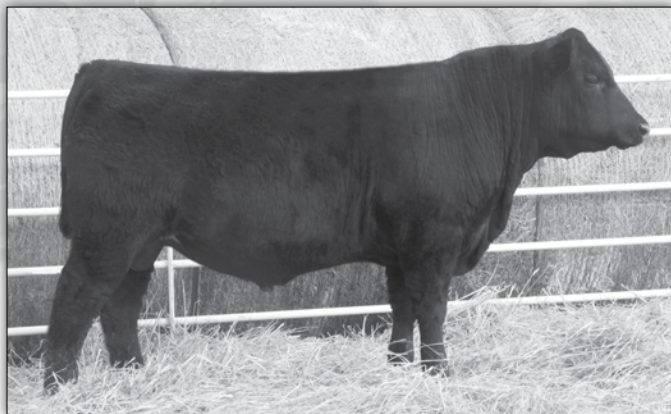
Molitor BankAble 7041-510 Lot 21