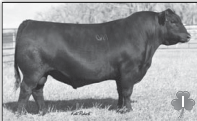
Reisig Intrigue 4407 - Sire of Lot 64.