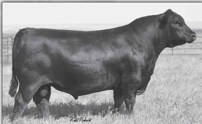
Cherry Creek Land Grant - Reference Sire F