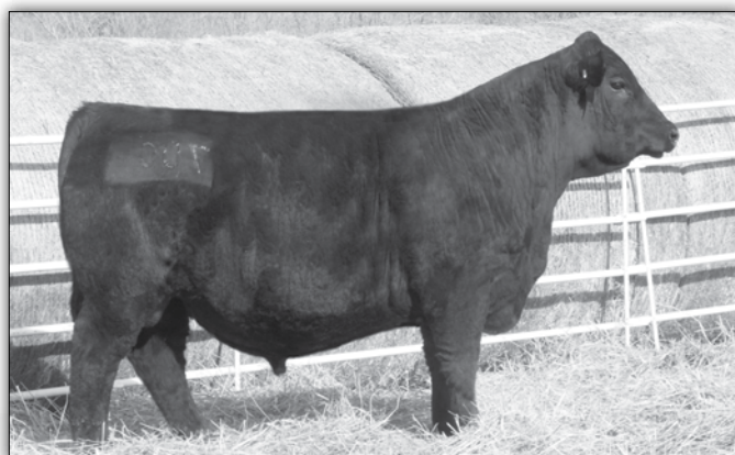
Molitor Land Grant 600-700 - Lot 52