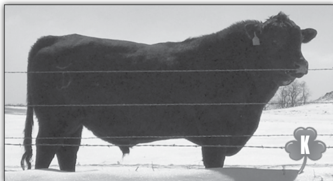
DAR Pay Upgrade Q807 - Sire of Lot 75

The sire continues to see heavy use in our Fall Calving cow herd. Several of his sons have been sale features in the OK & T Annual Angus Sale in Buffalo, OK. Sons are noted for having excellent growth, docility, marbling and milk EPDs. This bull ranks 4th for Marbling and 6th for $Grid in the sale. In the breed, Top 20% for WW, YW, Milk, Marbling, Docility and $Grid. ADG Ratio 107.