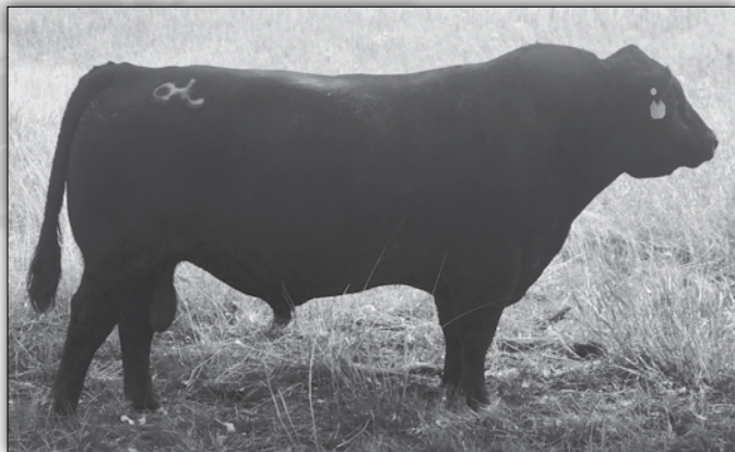
HARB Playboy 581 JH - Reference Sire M