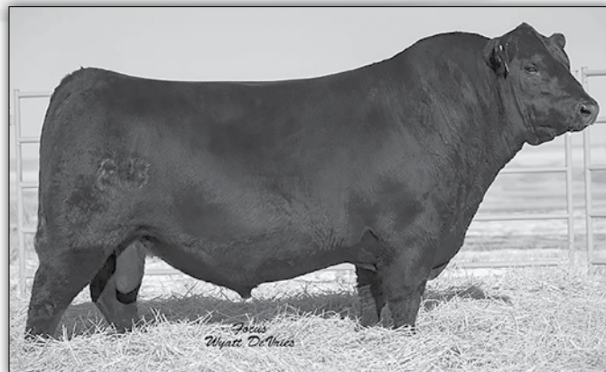
BUBS Southern Charm AA31 - Reference Sire D

• Among the sale females, she is 1st for $Beef and 2nd for $C, 3rd for $Grid and 6th for Marbling. In the breed, she is in the 35% or better for all these traits plus CED, BW, Docility, Milk, $F and $C. OCV and OPEN.