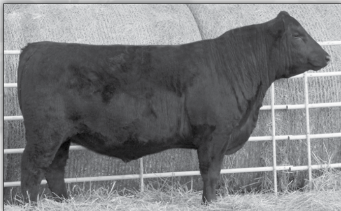
Molitor Flat Top 846-010 - Lot 32