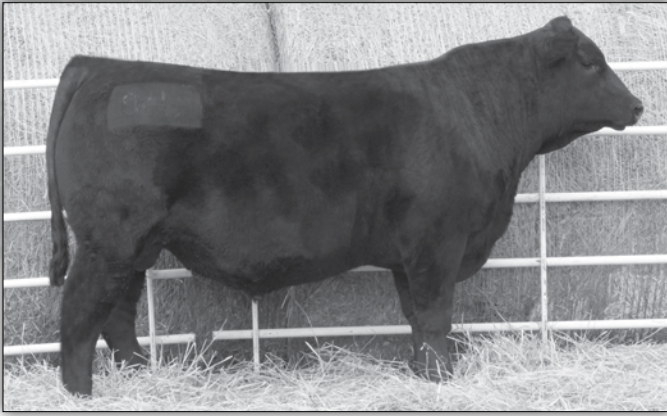
Molitor Bankroll 4024-440 - Lot 11