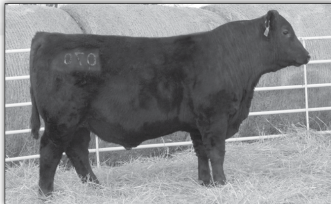
Molitor Flat Top 6025-070 - Lot 34