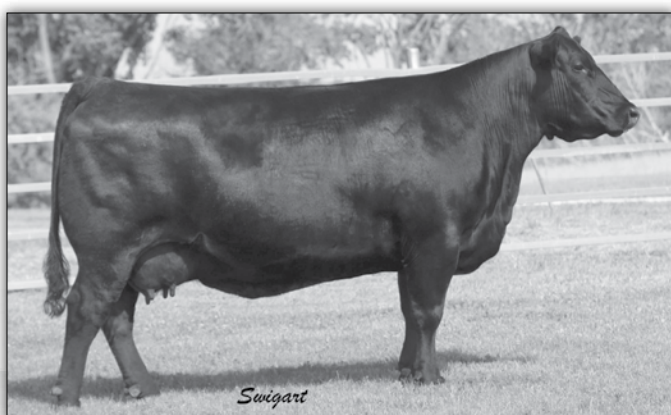
Werner Lady 0304 - Dam of Werner Flat Top 4136 - Reference Sire C

This Trailblazer daughter sorts herself by posting some Top values among the sale offerings. She is the Top Female in 3 categories: Marbling, $C and $Grid. 2nd high for $Beef. In the breed, she is 25% or better for 10 various EPDs ranging from Calving Ease, Growth, Carcass and $Value Indexes. OCV and OPEN.