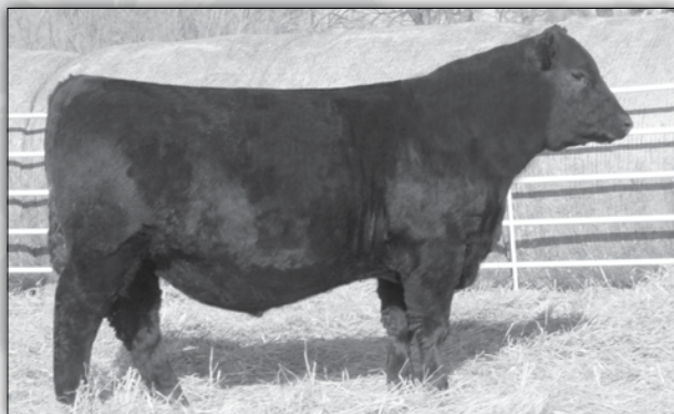
Molitor Trailblazer 847-800 - Lot 1