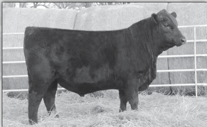
Molitor Land Grant 597-750 - Lot 53