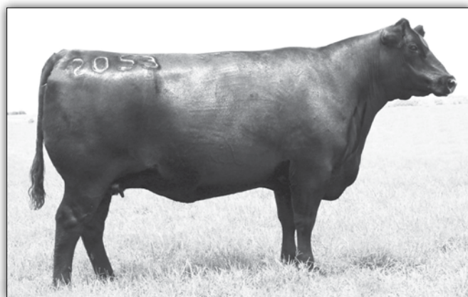
LD Dixie Erica 2053 - Great Grandam to LD Bankroll 704.

If you want calves born easy with explosive growth to weaning and yearling, take a look at this bull. Top 10% for WW and YW. Top 20% for $Wean. Top 15% for CED, BW, CEM, CW and $Feedlot. ADG Ratio 105.