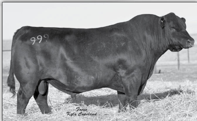
LD Emblazon 999 - Molitor Herd Sire and ABS Global Bull