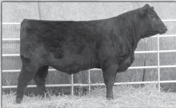
Molitor Flat Top 828-050 - Lot 37