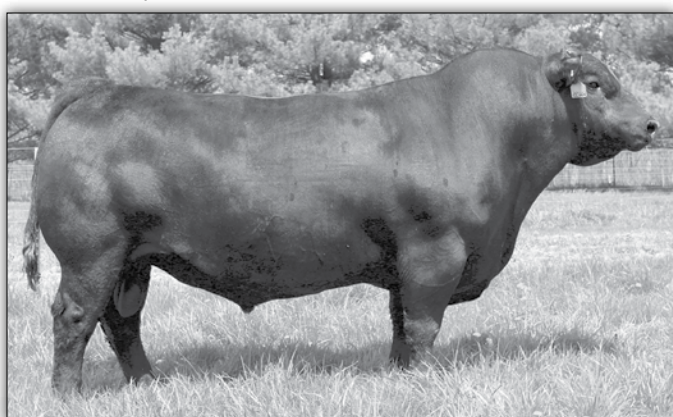
LD Capitalist 316 - 3/4 brother to the dam of LD Bankroll 704 tracing to the famous LD Dixie Erica 2053 cow family

These sons of LD Bankroll 704 exhibit great values for Calving Ease, yet possess the genetics to excel at Weaning and Yearling Weights. This bull ranks in the Top 10% of the breed for CED, BW and CEM.