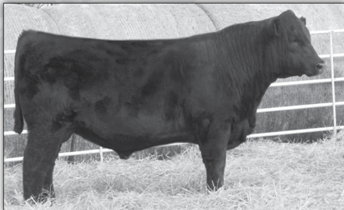
Molitor 165 Paywht 7010-280 - Lot 71