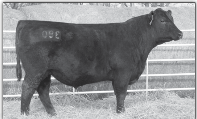
Molitor Bankroll 587-380 - Lot 10

A great calving ease trait bull that ranks in the Top 1% of the breed for CED and BW. YW in the Top 20%. The dam is a Pathfinder Cow with a WR 105 on 4 calves, and contributes great influences for high maternal and fertility traits. A 3/4 brother to Lot 9.