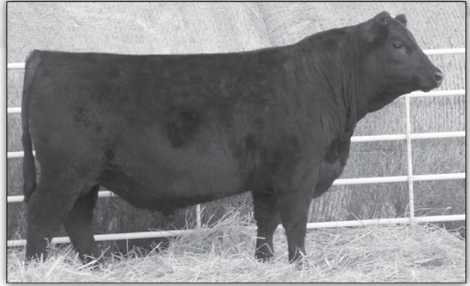
Molitor Bankroll 5026-410 - Lot 13

• You will appreciate the well balanced conformation and calving ease traits of this Bankroll son that ranks 5th high for HP among the sale bulls. In the Angus breed, he is in the Top 20% or better for CED, BW, DOC, HP and $Wean. His 999 dam is a top producer with a WR 104 on 5 calves. ADG Ratio 108.