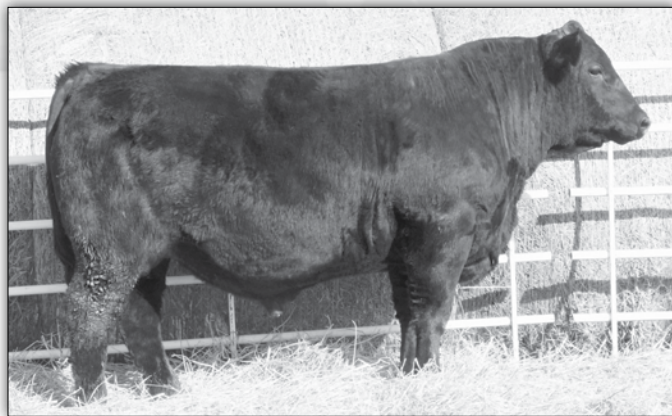
Molitor Flat Top 572-150 - Lot 40