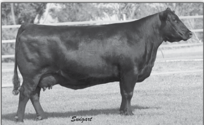
Werner Lady 0304 - Dam of Werner Flat Top 4136

A 7/8 brother to Lot 30, this bull also shows great strength in Calving Ease and Yearling Growth. Ranks in the Top 15% or better for CED, BW, YW and Docility. ADG Ratio 112.