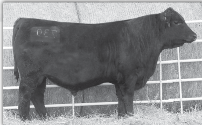
Molitor Land Grant 808-730 - Lot 55