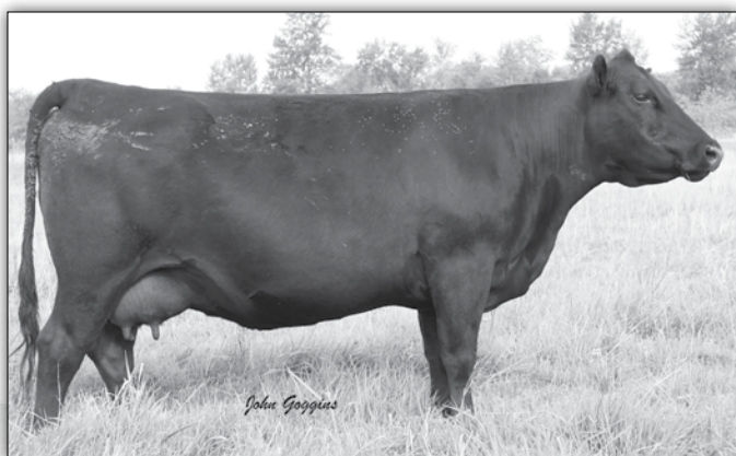
HARB Jerica 876 JH - Dam of HARB Playboy 581 JH

• A female with the genetics for economic savings. In the sale group, she ranks 4th for $EN. She is also in the Top 10% of the breed for Reducing Maternal Weight and Height. OCV and OPEN.