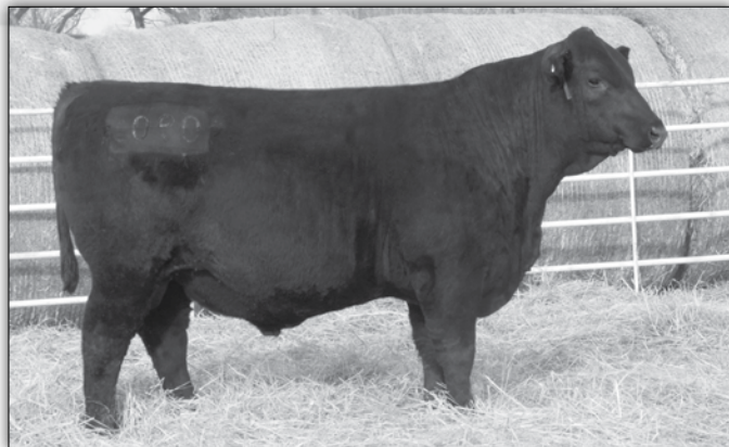
Molitor 165 Payweight550-090 - Lot 74

This bull has the #1 value for both $Maternal and $EN amongst the sale bulls. He is designed to lower economic costs in your cow herd, projecting also possible Reduction in Mature Weight and Height. ADG Ratio 103.