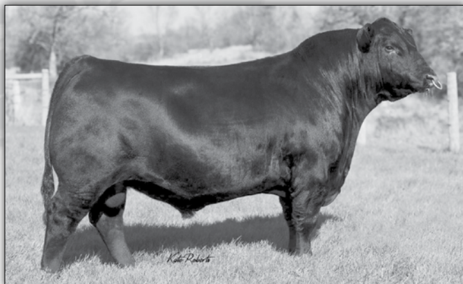
Werner Flat Top 4136 - Reference Sire C