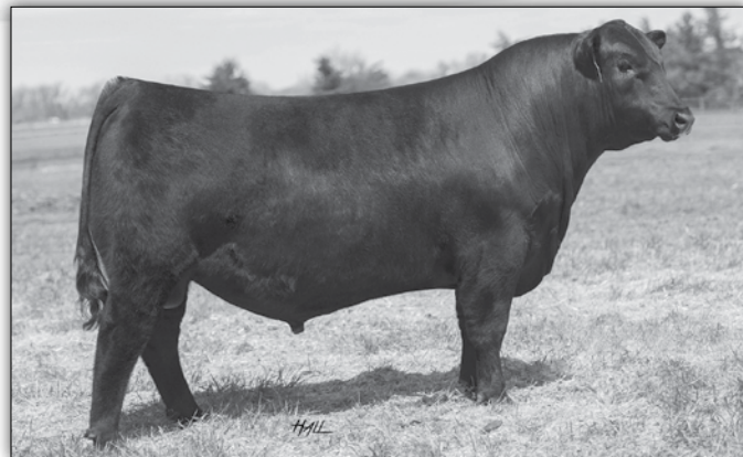
Barstow Bankroll B73 - Sire of LD Bankroll 704 - Reference Sire T