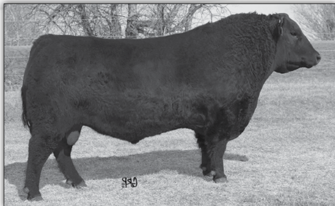
Musgrave Aviator - Sire of Bluegrass Aviator 700 - Reference Sire R