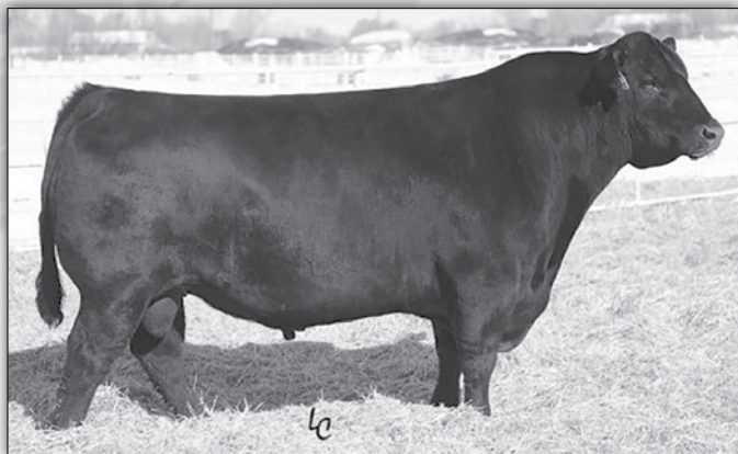
KG Solution 0018 - Reference Sire G