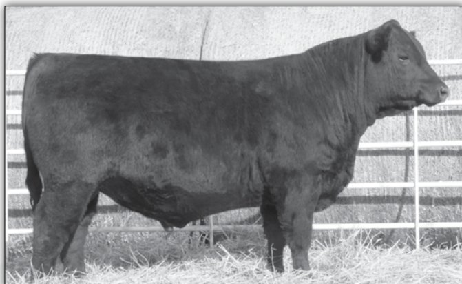
Molitor Solution 687-630 - Lot 60

• Do not miss this son of Solution that posts the 5th high value for Docility amongst the sale bulls. He puts together a top ranking list of traits such as Low birth weight, Weaning, Yearling, Growth, Docility, HP, $M, $W and $G. A complete bull for birth weight, growth, carcass and maternal fertility. ADG Ratio 112.