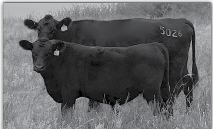
Lot 13 with his Dam 5026 taken August 2020.

• In the Angus breed, ranks in the Top 10% for CED and BW. These Bankroll sons are an impressive group of bulls that have calving ease traits yet rank in the Top 30% of the breed for growth performance. ADG Ratio 105.