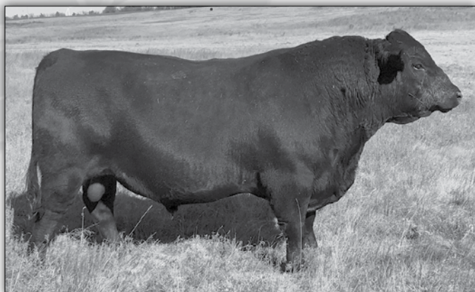
Molitor Payweight 3015-165 - Reference Sire J