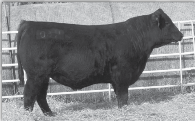
Molitor 731 Bankroll 718-460 Lot 15