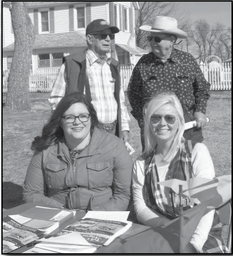
Sale day welcoming crew.