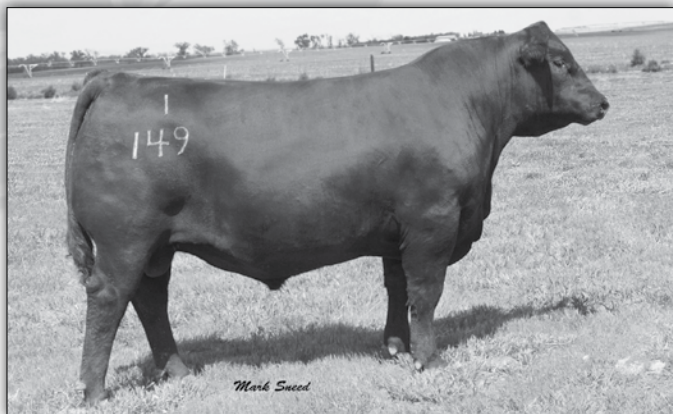
Conneally Cavalry 1149 - Sire of SVF Calvary B323 - Reference Sire P