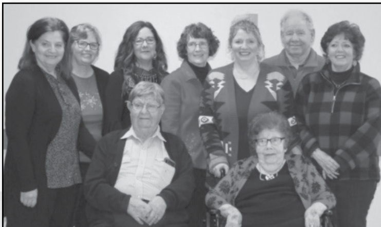
and now 42nd sale!