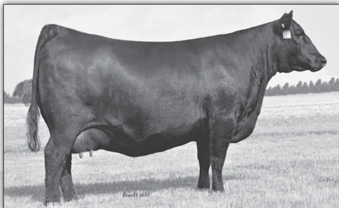
Buford Elba 9000 - Dam of Reisig Intrigue 4407, Reference Sire I.